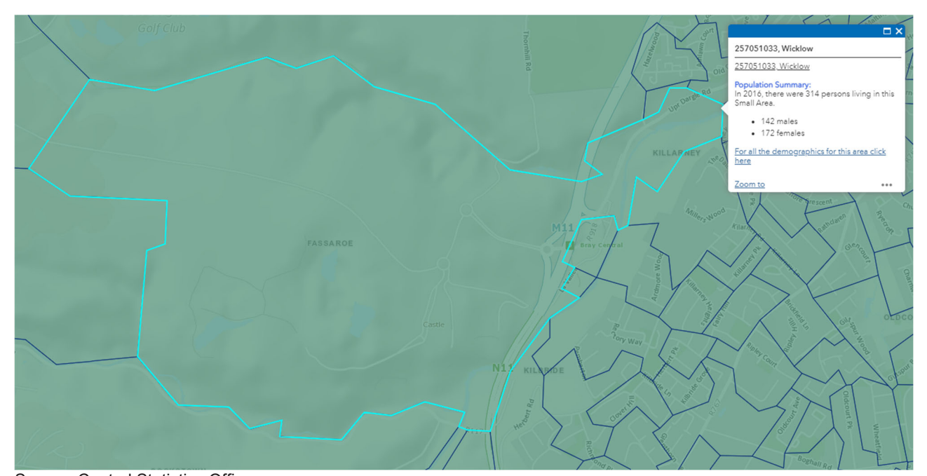
Figure 1: Catchment Area

The catchment area for the purpose of this assessment is based on the Central Statistics Office Small Area Code SA 257051033. This Small Area encompasses the development site along with small area of land immediately surrounding the site. Figure 1 below illustrates the proposed catchment area.